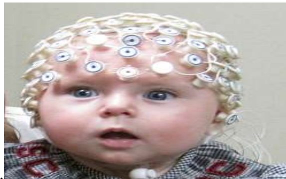
Fig 1.1 a) EEG

After signal acquisition phase, Signals are to be preprocessed. Signal preprocessing means enhancement of signal by apply some signal processing techniques. In General, the acquired brain signals are contaminated by the noise and artifacts. The artifacts such as eye blinks, eye movement, Heartbeats are the reasons why experience is required to interpret EEGs correctly. In addition to these, muscular movement and power line interference is also involve mingled with brain signal as stated by ( Teplan, 2002 ). Artifact removal can be done using some common techniques like Common Average referencing (CSP), Principal Component analysis (PCA), Probability Based principal component analysis (PPCA) and independent component analysis (ICA). After these first step signal is passed for the Normalization, local averaging techniques, Robustkalman filtering, common spatial subspace decomposition (CSSD) etc. which are generally the most common techniques for Filtration