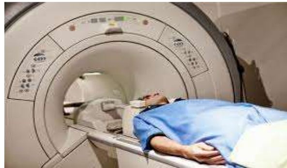
Fig 1.2 b) fMRI